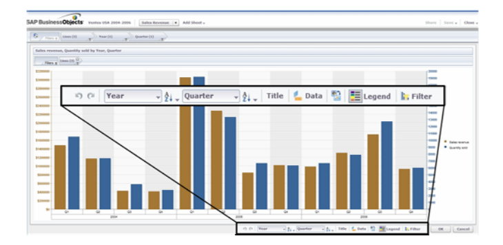
Fig. 3. The "Explore" mode is a detailed view of a chart, where users can undo/redo actions, choose data categories, sort items, change data sources, switch chart templates, and create local data filters. To avoid switching to the "explore" mode, part of this functionality is also available as a drawer toolbar for each chart in the main dashboard, with added options to lock the chart.

types include comparisons (sales by state or year), contributions (the percentage of sales per state over all sales), or trends (the evolution of sales over time). If the user selects one of these analysis types, the system automatically recommends visual templates (charts) suitable to the specific analysis and to the nature of the attributes (e.g. how many measures and categories are selected, if they are categorical, ordinal, etc), using a default visual mapping. These recommendations are ranked from simple and more commonly used charts to more complex ones, and aid novices to explore reasonable alternatives. Available visual templates include charts, gauges and tables.