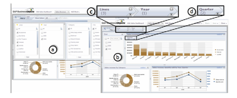
Fig. 5. Filters and Faceted navigation creation. (a) The user can drag-and-drop a new global filter and choose the data categories that will be visible on the dashboard. The filter is either directly applied, or can become a filter control component for faceted navigation (b). All active global filters are visible at the top of the dashboard (c), and local filters on the top of charts (d).

To help users follow visual changes during data exploration, when using OLAP functions or filters, changes are smoothly animated to ensure visual momentum [34].