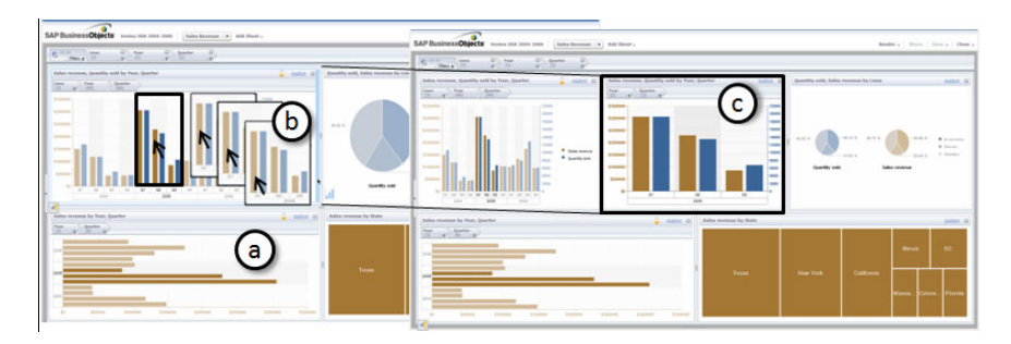
Fig. 4. (a) Users select subset of their data, that get highlighted in all charts. (b) They drag their selections outside the chart to create a cut-out clone visualization (c), of the same type (here bar chart) with the selected data only. A blue highlighted bar (b) indicates the new chart will be placed on the right of the original, with existing charts shift to accommodate it (c).

without risking loosing existing components. To further ensure that novice users are not afraid to experiment with their dashboards, all actions are reversible through undo history functionality applied on the entire dashboard and locally on specific charts.