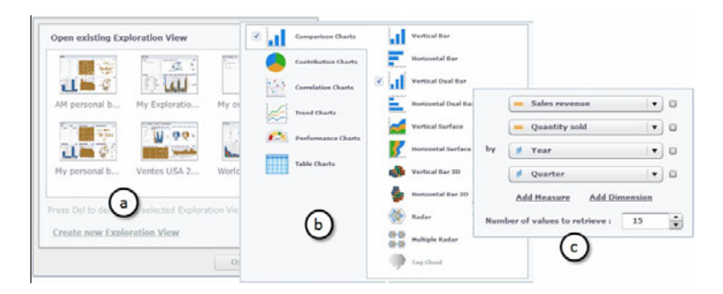
Fig. 2. (a) Creation dialogs with visual examples of templates or saved dashboards. (b) Chart creation dialog with recommendations of charts appropriate to data categories and analysis types, sorted from simpler to more complex. (c) Data Category and measures selection.

Finally, if the design of EV supports both low-cost experimentation with visual templates and visual analytics processes, it can help novice users to become more accustomed to visualization creation and analysis, promoting learning .