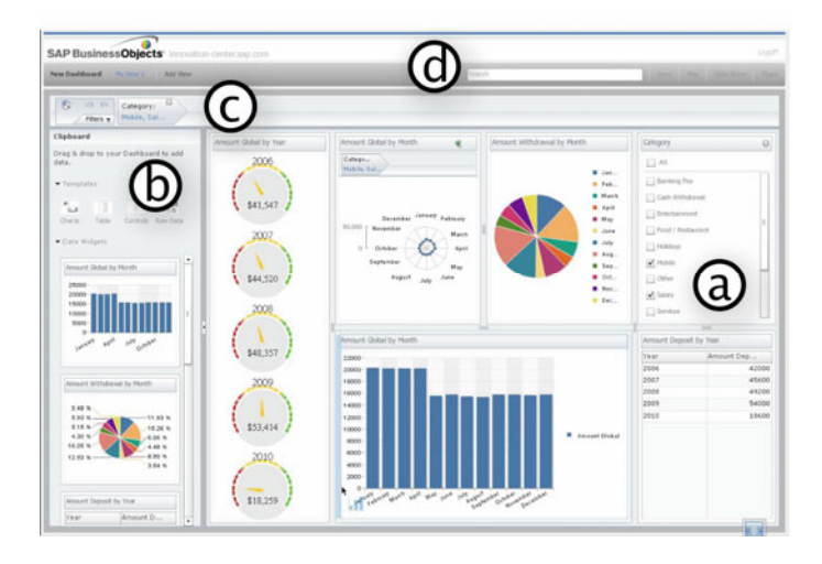
Fig. 1. The Exploration Views consists of: (a) the main Dashboard and its components. (b) The Clipboard drawer widget that includes templates for charts (top) and data widget samples (bottom) that the user has created as a pallet. The drawer can be closed when not needed. (c) A visual representation of the global data filters that are active at any point. (d) And a set of other functions, such as search, save, share, etc.

Our contribution consists of: (i) putting together all guidelines for novice users (empirical or tested) in a fully functional system that can be tested in practice, (ii) creating a system that also includes advanced functionality required by expert users, and (iii) testing the system under realistic tasks to gain insights.