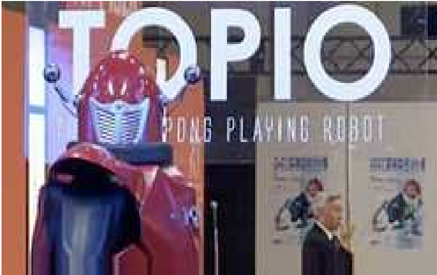
Table tennis ==> quite hard

(limited task: guessing the spin of a ball ?)