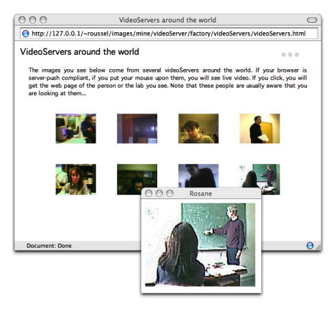
Figure 4. Focus control: from a low resolution snapshot in a Portholes-like awareness view to a high frame rate independent video that the user can freely move and resize.

video services can also be combined to support more complex interactions. A few lines of JavaScript, for example, can turn a static picture into a medium frame-rate video (e.g. 15 fps) when the mouse moves over it and pop up a new window displaying a high frame-rate and resizable stream when one clicks on it (Figure 4). While a previous study suggested that people have difficulty extracting information from snapshots unless the resolution is at least 128x128 pixels [21], experience with this three-scale focus control indicates that snapshot resolution can be reduced up to 80x60 as the ability to turn them into video streams helps resolve ambiguities.