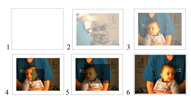
Figure 8. Transitions between the sleep mode (1), the mirror mode (2 to 5) and the picture transmission mode (6).

A remote control allows to switch the system into a browsing mode that shows the pictures taken by all the connected videoProbes. Within this mode, users can delete selected pictures or save them in a persistent album. Pictures not saved in the album gradually loose their colors and contrast and eventually disappear from the browsing interface after a few days (Figure 9).