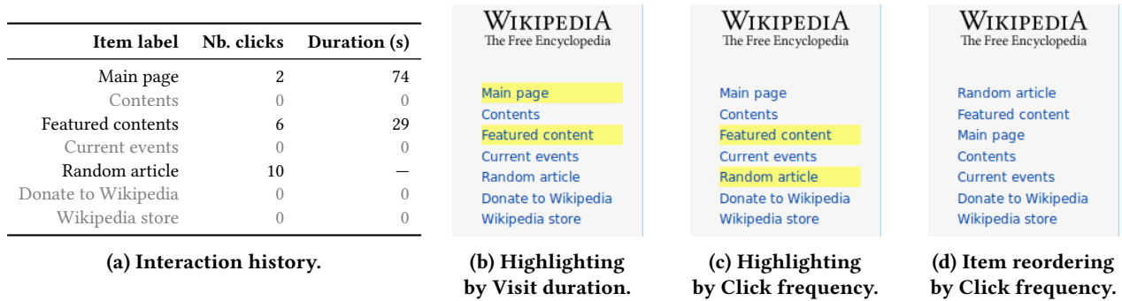
Figure 2: Various adaptive menus produced by SAM on Wikipedia, given a single interaction history (a). Changing the target policy (b → c) or the adaptation style (c → d) both result in different adaptive menus.

They then initialise the framework by calling the static builder method fromSelectors on the global SAM object—which is exposed in the global scope by sam.js . This step requires the DOM to be fully loaded: