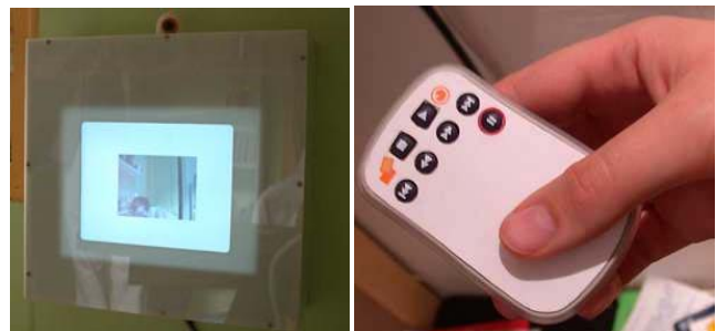
Figure 3. videoProbe (left) and customized remote control (right)

Despite problems with robustness, the probes were helpful in revealing communication patterns and technology needs and desires. Many of the messages in the U.S. family involved attempts at coordination for things like picking up children, indicating that this is a promising area of research for new technologies. In addition, the playful use of the probe by the Swedish family indicated a desire for simple, fun ways of providing remote awareness between households. The probes also revealed more subtle aspects of communication in the families that would likely not have come up in interviews – i.e. the unique communication habits of the Swedish sisters and the U.S. grandparents.