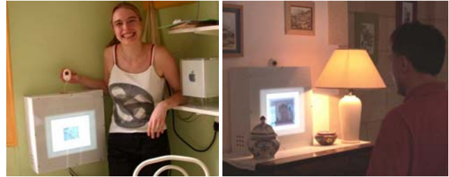
Figures 4. videoProbes in the French families' homes

To simplify the use of the videoProbe, we created a custom-made graphic design for the remote control. Our earlier tests showed that even the few tasks executed by the remote control could be confusing. It was not obvious how to put an image into or remove it from the album, and these actions are not clearly related to culturally-established VCR control iconography, such as <<, >, >>. Note that users also face these problems when attempting to manipulate stored images on commercial digital cameras.